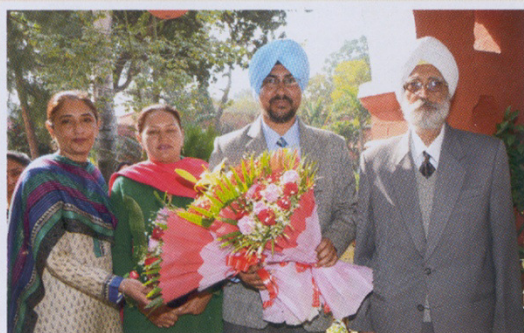
A warm welcome!