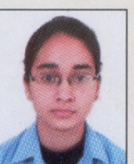
Kritika BCA-III VIII in Univ.