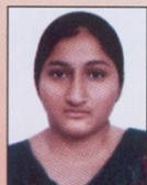
Salony BCA III I in Univ.