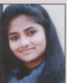
Chahat BCA-III IV in Univ.